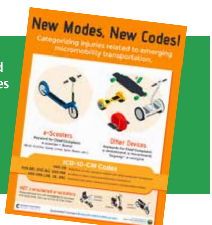
Figure 3. Poster used in North Carolina and other cities and States to promote more consistent coding of micromobility related injuries in hospitals.

Identifying crashes that involve e-scooters can be challenging as there are no universally adopted standardized reporting mechanisms and vendor and police reporting generally under-represents e-scooter crashes. To date, emergency department data are regarded as the most comprehensive source of crash information and several cities are working with their local health departments and hospitals to standardize reporting to more easily identify e-scooter-involved injuries. For example, the North Carolina Department of Health and Human Services distributed guidance statewide on ways to code micromobility-related injuries. The information was shared in the form of a poster to