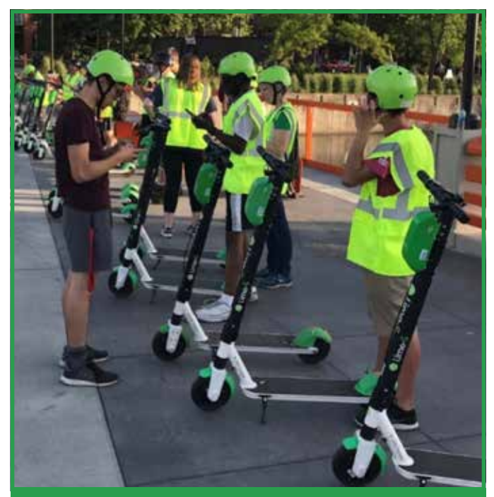
Figure 4. City staff leading an e-scooter educational event in Spokane, Washington.

Cities also expressed concerns about where e-scooter riders were choosing to ride and to park their devices. In addition to considering ways to establish more clear places to ride and park through infrastructure, paint, and signage enhancements (discussed in following sections), most cities had some form of training or ambassador program and/or communications effort to help engage the public in adopting a safer and more considerate riding culture (see Figure 4).